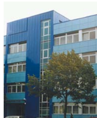
TRADE SCHOOL IN KREUZBERG, BERLIN