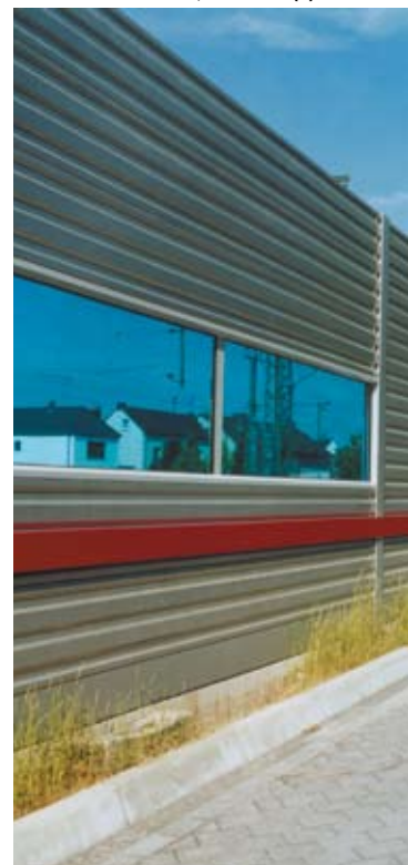
NOISE-PROTECTION WALL, TROISDORF (D)

Hertha Hurnaus Photo Knospe & Co die licht gestalten Fotostudio GmbH HKR Systembau