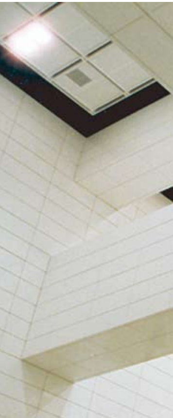
TSING YI STATION, HONG KONG