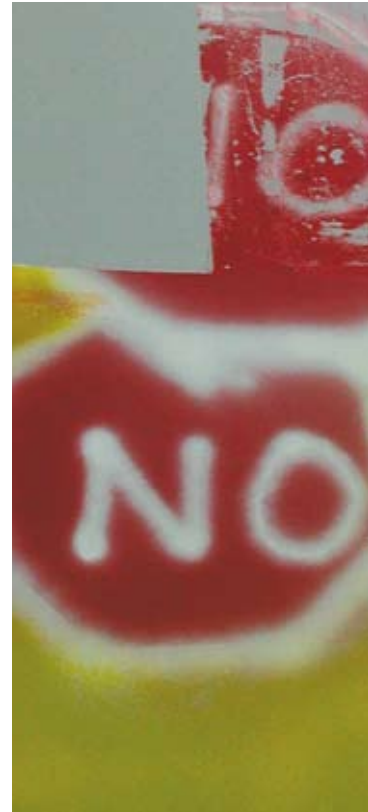
CLEANING OF COATED (SERIES 44) SURFACE, STAINED WITH GRAFFITI